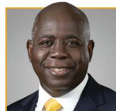
PM Philip Brave Davis

Since the Paris Agreement of 2015, public and private corporations ▶ 2