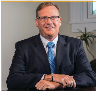
Ryan Pinder, Attorney General and Minister of Legal Affairs

interactions with the United Nations; international cooperation; and enforcement tools. The amendment being proposed empowers The Financial Intelligence Unit (FIU) to impose an administrative penalty on any Financial Institution who contravenes of the Act. This will require financial institutions to report any property used for commission of offences under the Act. In the original legislation no criminal nor administrative penalty was assigned to this obligation. The amendment will assist the FIU in enforcing compliance with the provisions.